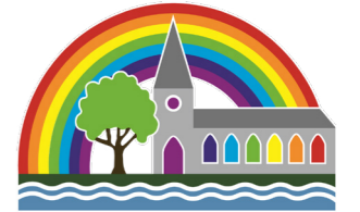
Bleasby C of E Primary School