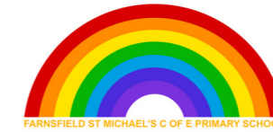
Farnfield St Michael's C of E Primary School