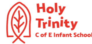
Holy Trinity C of E Infant School